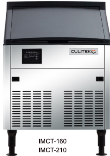
IMCT-160 IMCT-210 IMCT-280